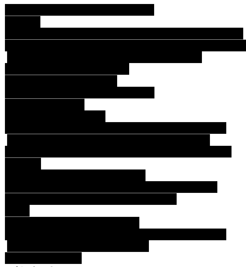
Total Expected Project Costs