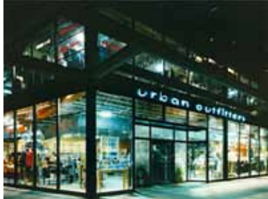
Rush Walton Collection