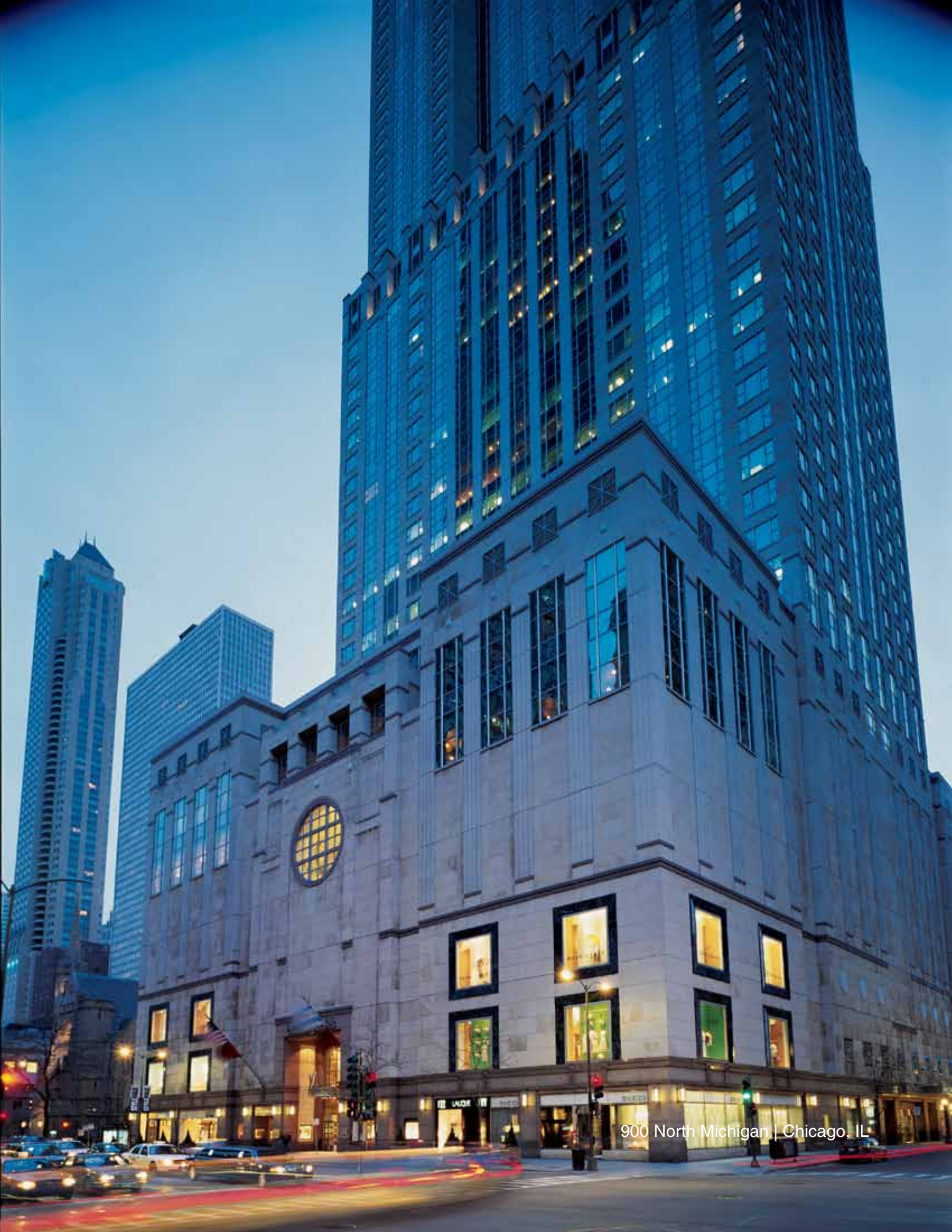
900 North Michigan | Chicago, IL