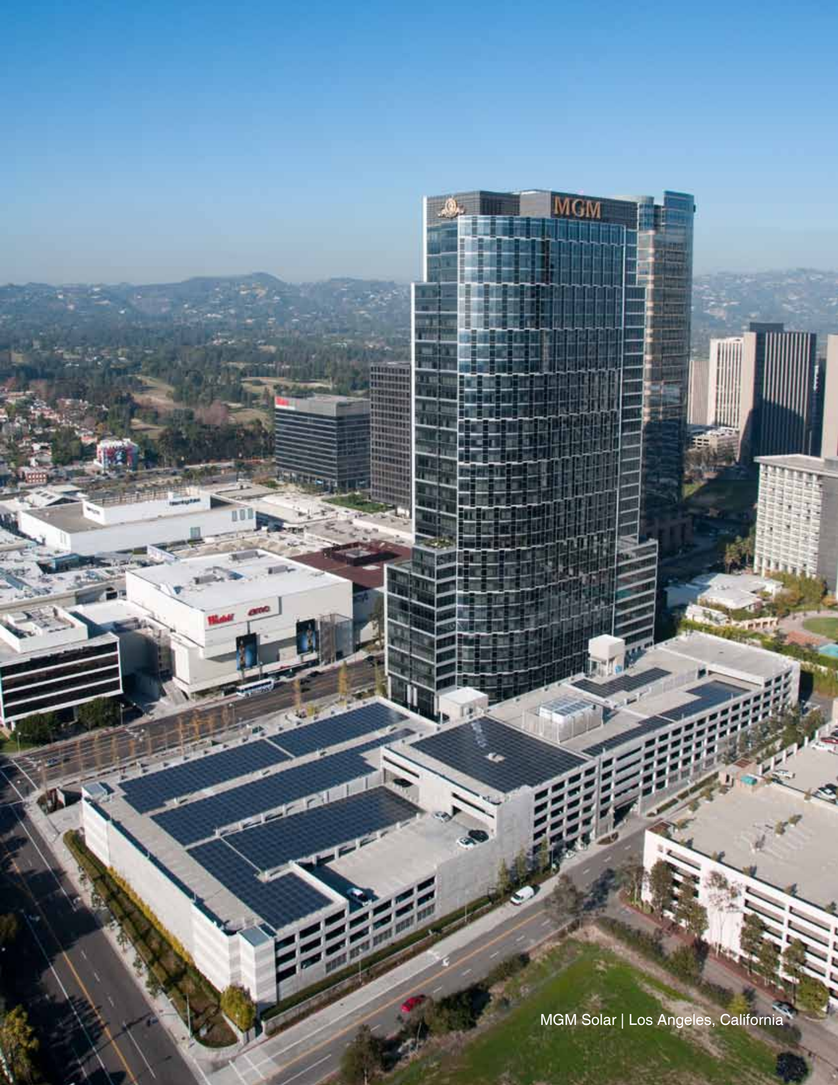
MGM Solar | Los Angeles, California