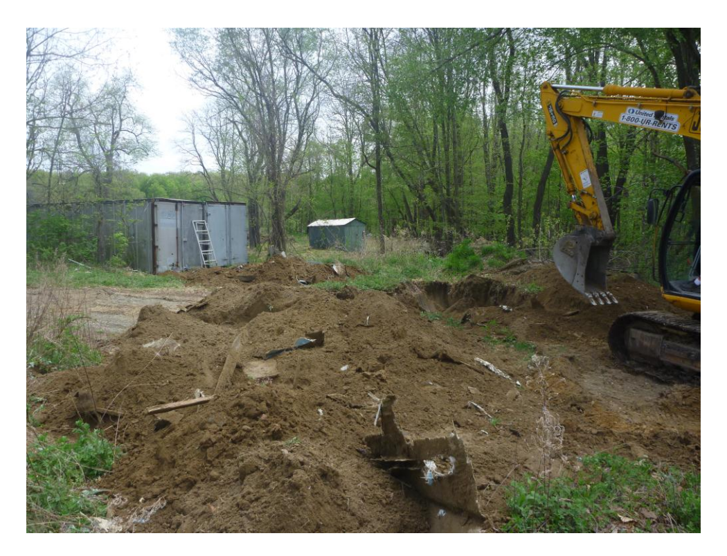
Photograph 10: View of a portion of the boat debris recovered from TP-7.