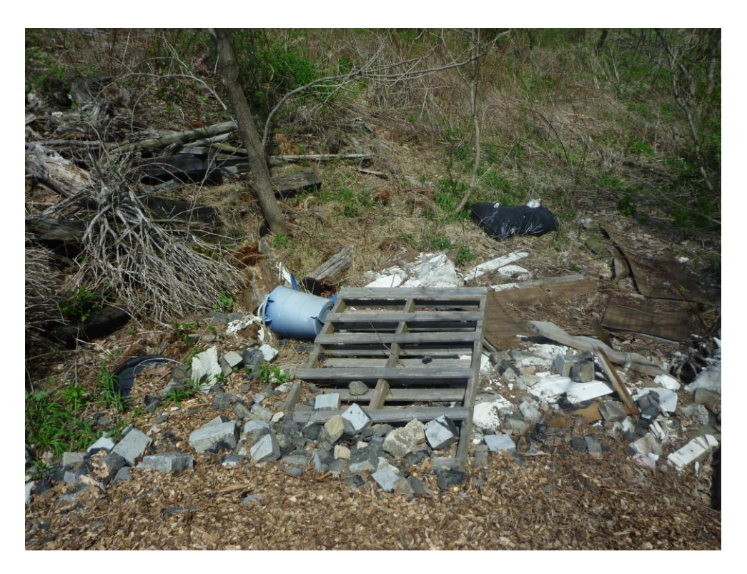
Photograph 19: View of Debris Pile #9 (Parcel #1), containing roofing waste, tires, concrete chunks, etc. View from north to south.