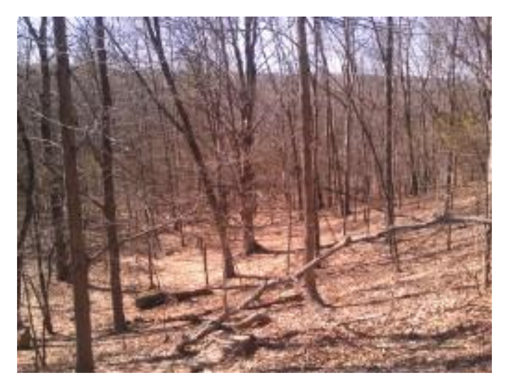
Photograph 29: Vacant, wooded area (Parcel #2). View from east to west.