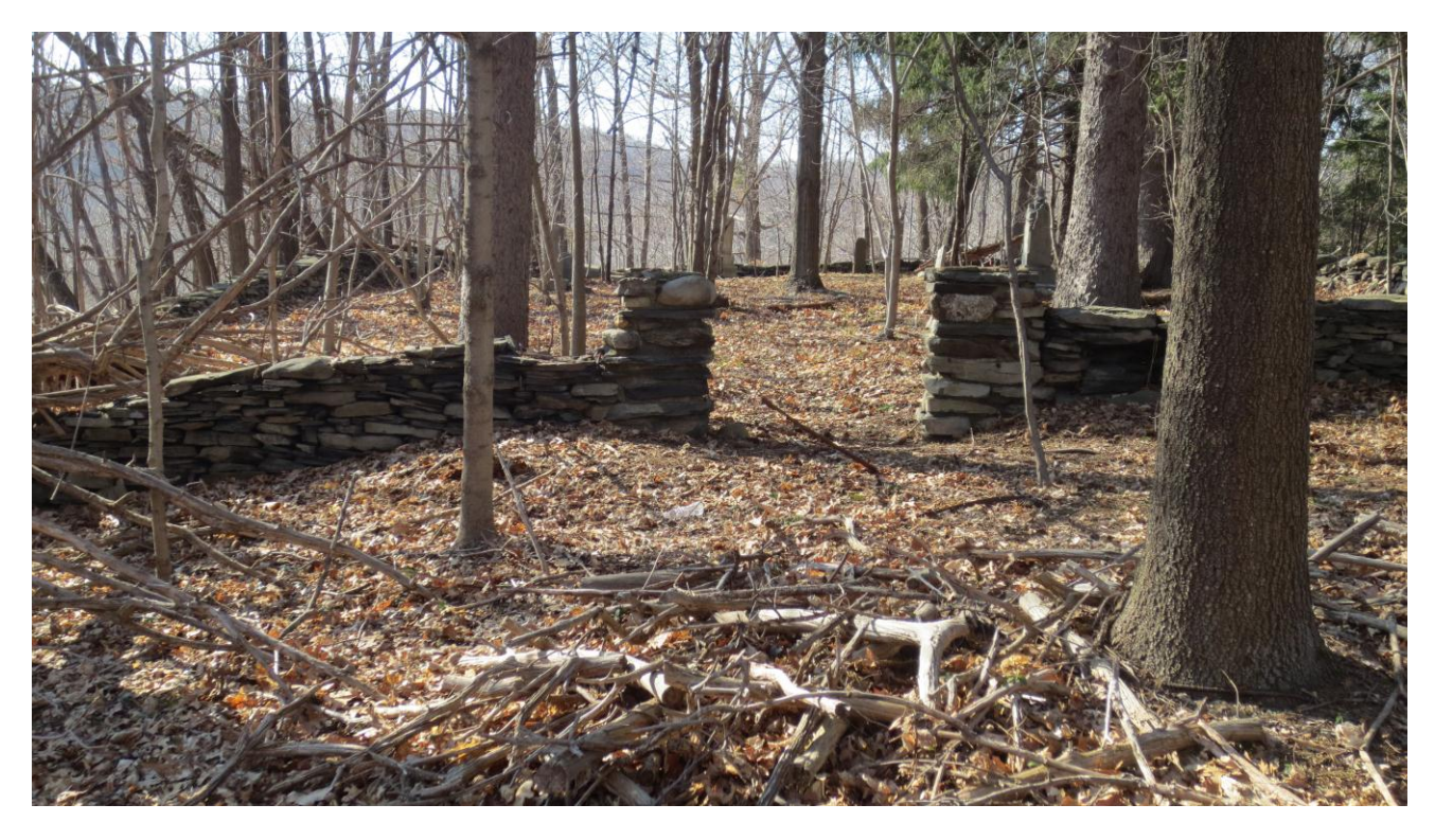
Photograph 7: Bull Family Cemetery. View from east to west.