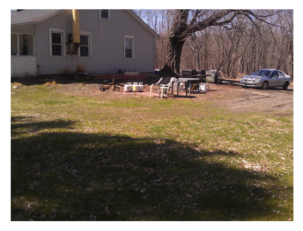
Photograph 8: Exterior north of McLaughlin residence. View from northeast to southwest.