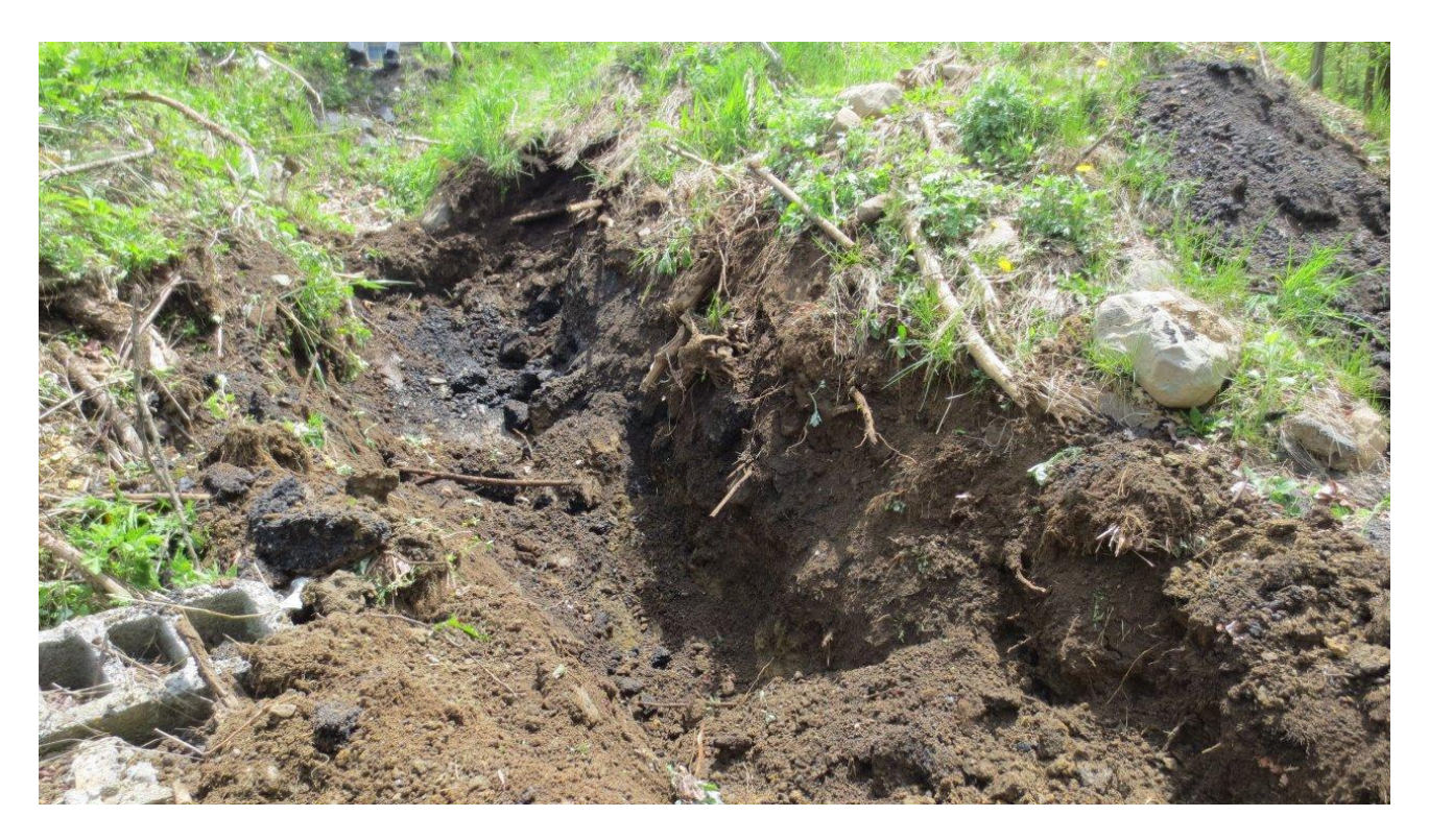
Photograph 1: View of the dirt, stone, and asphalt observed at TP-1.