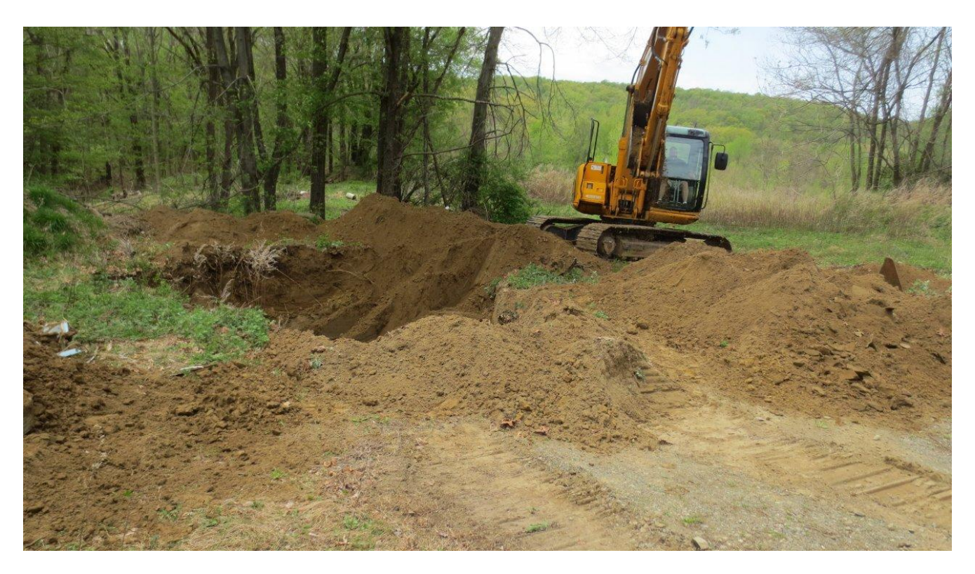
Photograph 9: View of the material excavated from TP-7, facing west.