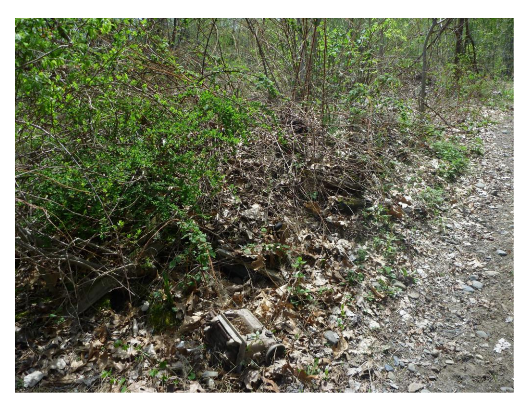
Photograph 18: Debris Pile #8 (Parcel #1). View from west to east.

Photograph 17: Debris pile #7 (Parcel #1), containing a buried water tank. View from south to north.