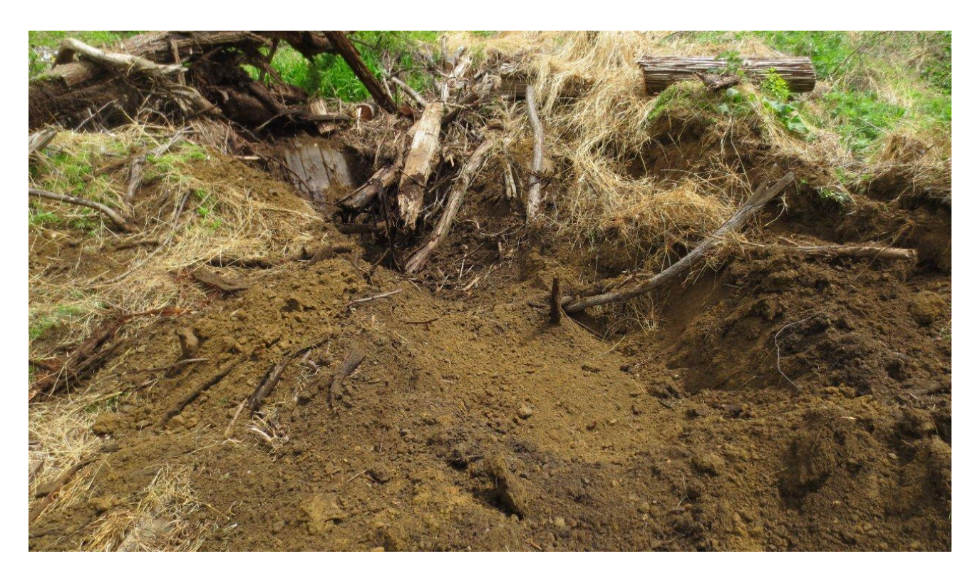
Photograph 3: Additional view of the tree debris observed at TP-2.