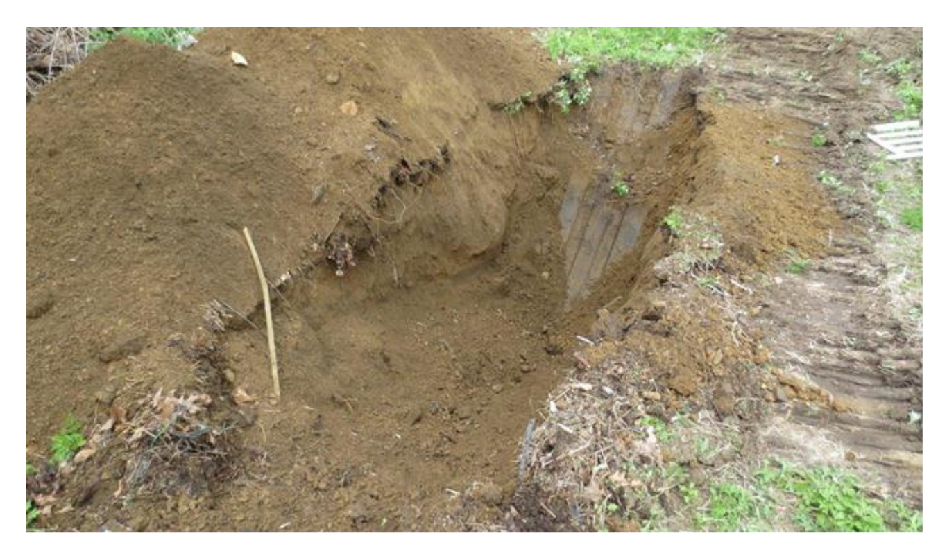
Photograph 7: View of the native sand observed at TP-6.