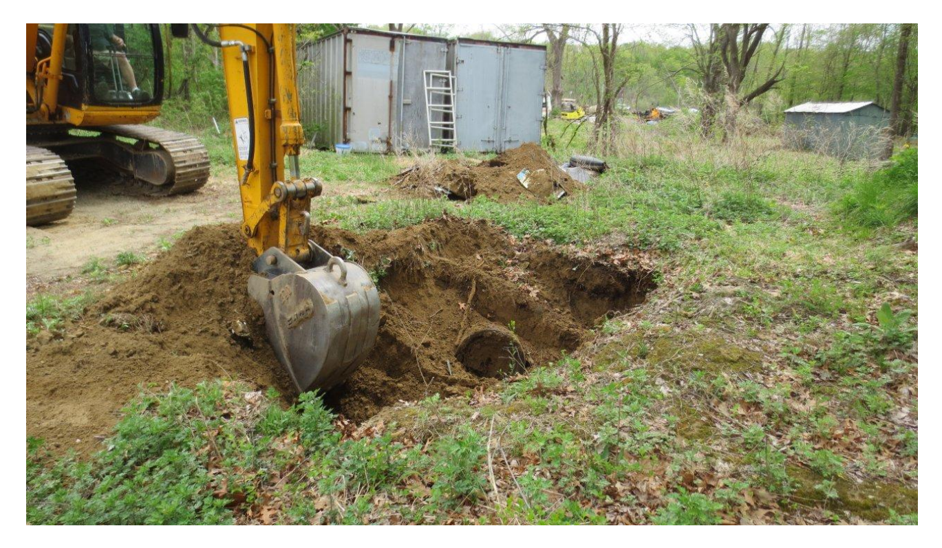
Photograph 8: View of the excavation of TP-7, facing east.