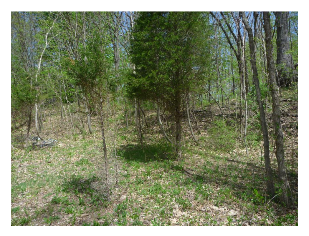
Photograph 14: Debris pile 4 (Parcel #1) of roofing waste. View from south to north.