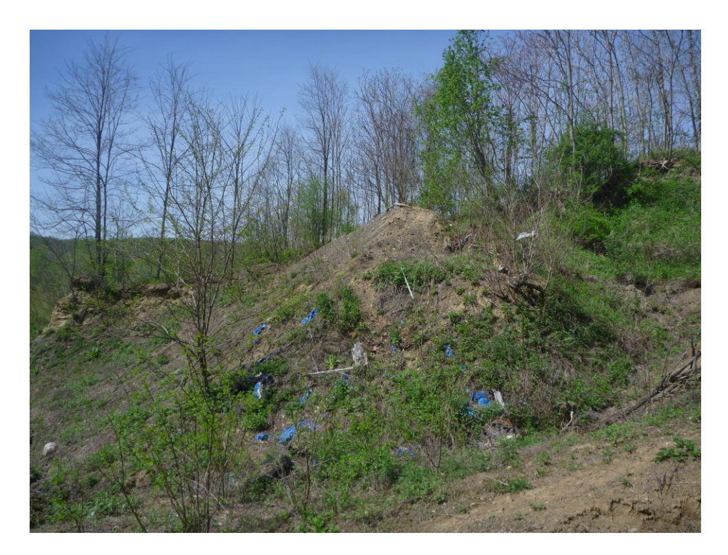
Photograph 12: View of the debris observed on the surface of TP-9