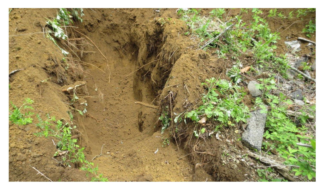
Photograph 4: View of surficial asphalt (right), dimensional lumber, and native soils observed at TP-3.