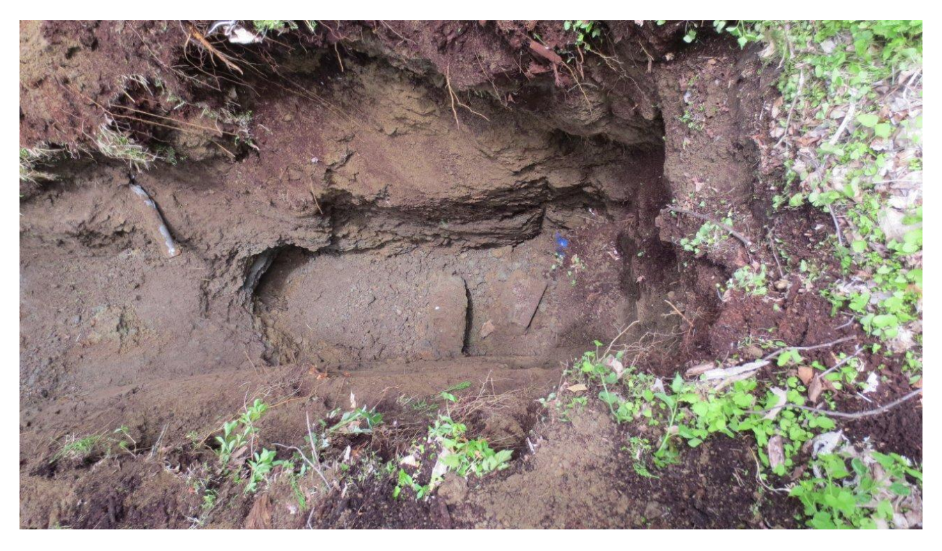
Photograph 11: View of the plastic conduit (left) and organic soil observed at TP-8.