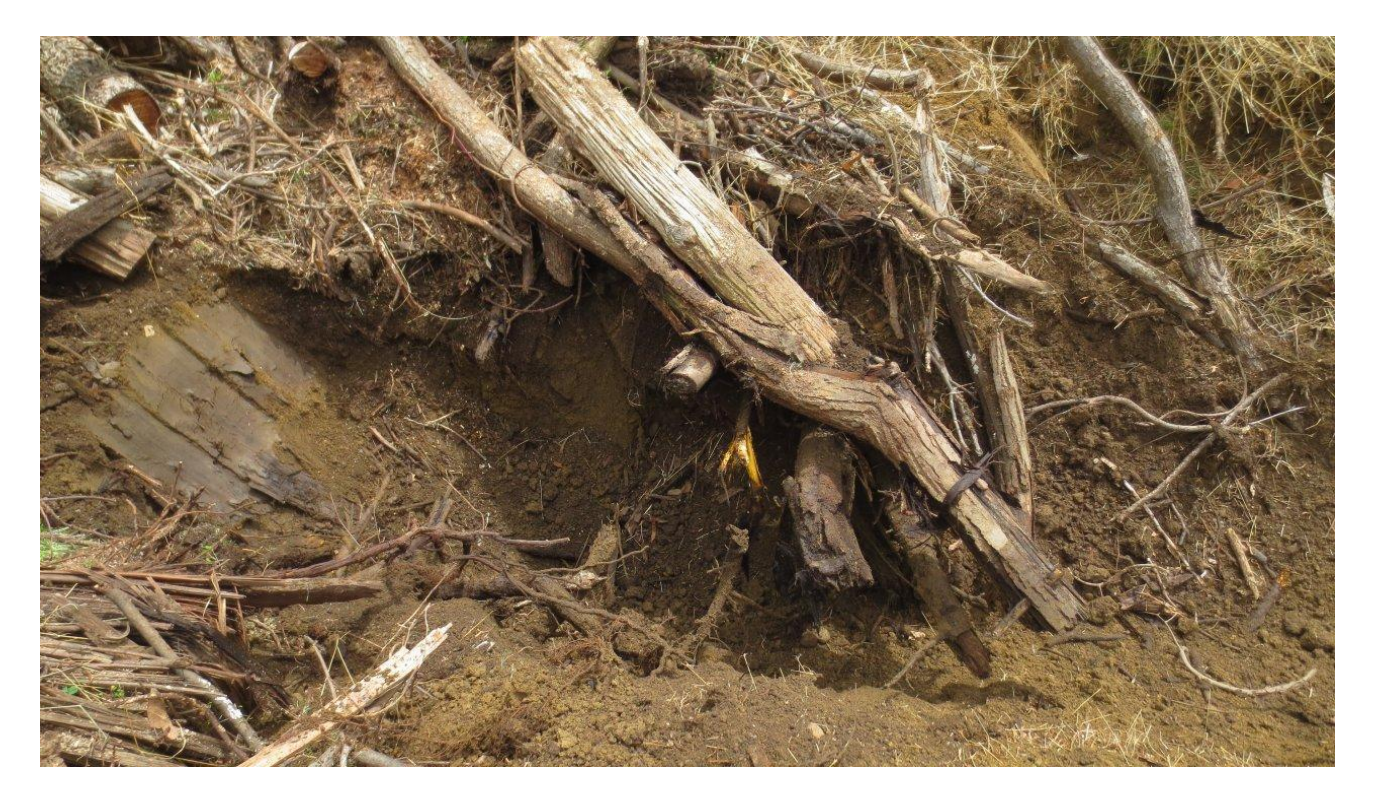
Photograph 2: View of the logs and tree debris observed at TP-2.