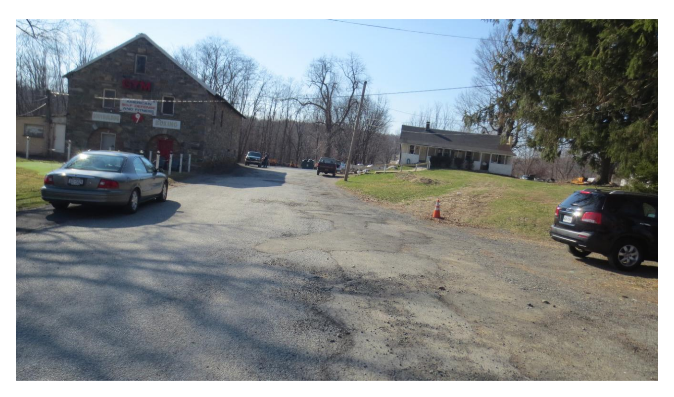
Photograph 3: Fairway Drive, stone barn, and McLaughlin residence. View from east to west.