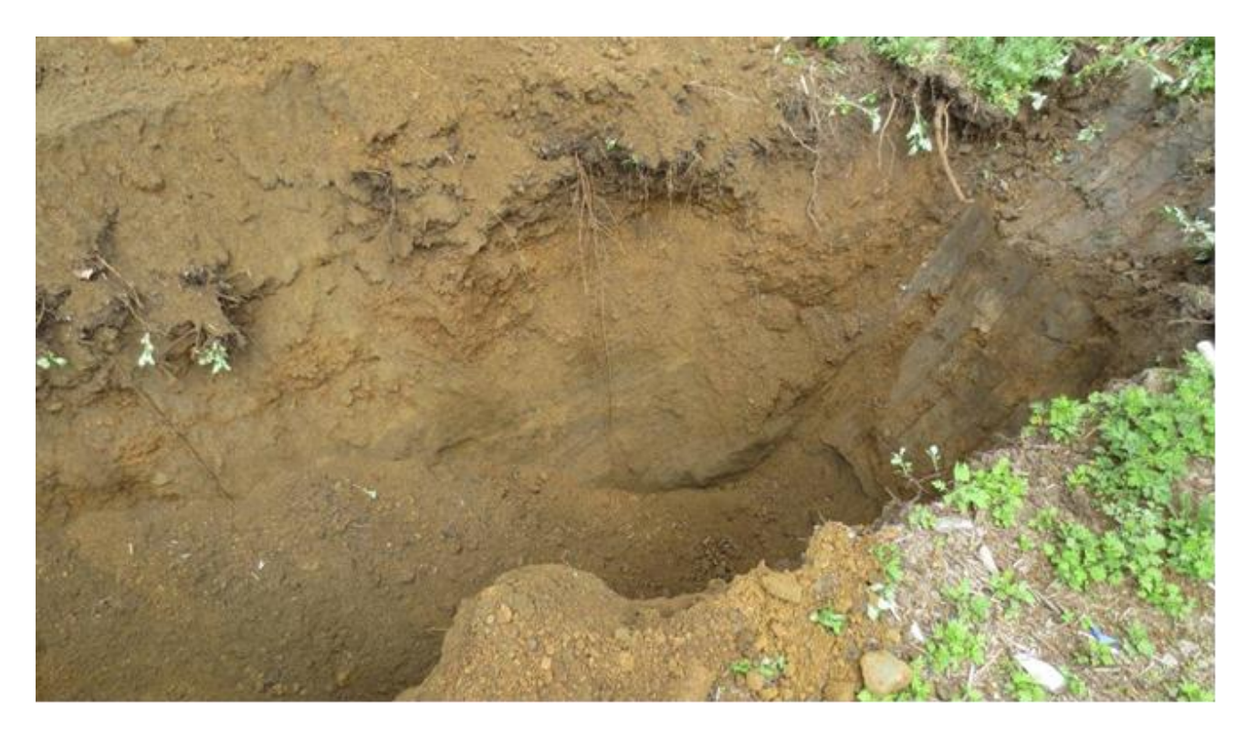
Photograph 5: View of the native sand observed at TP-4.