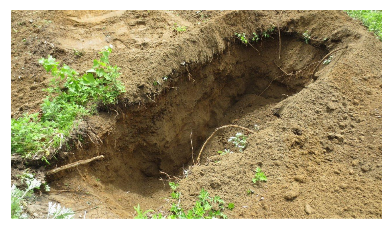
Photograph 6: View of the native sand observed at TP-5