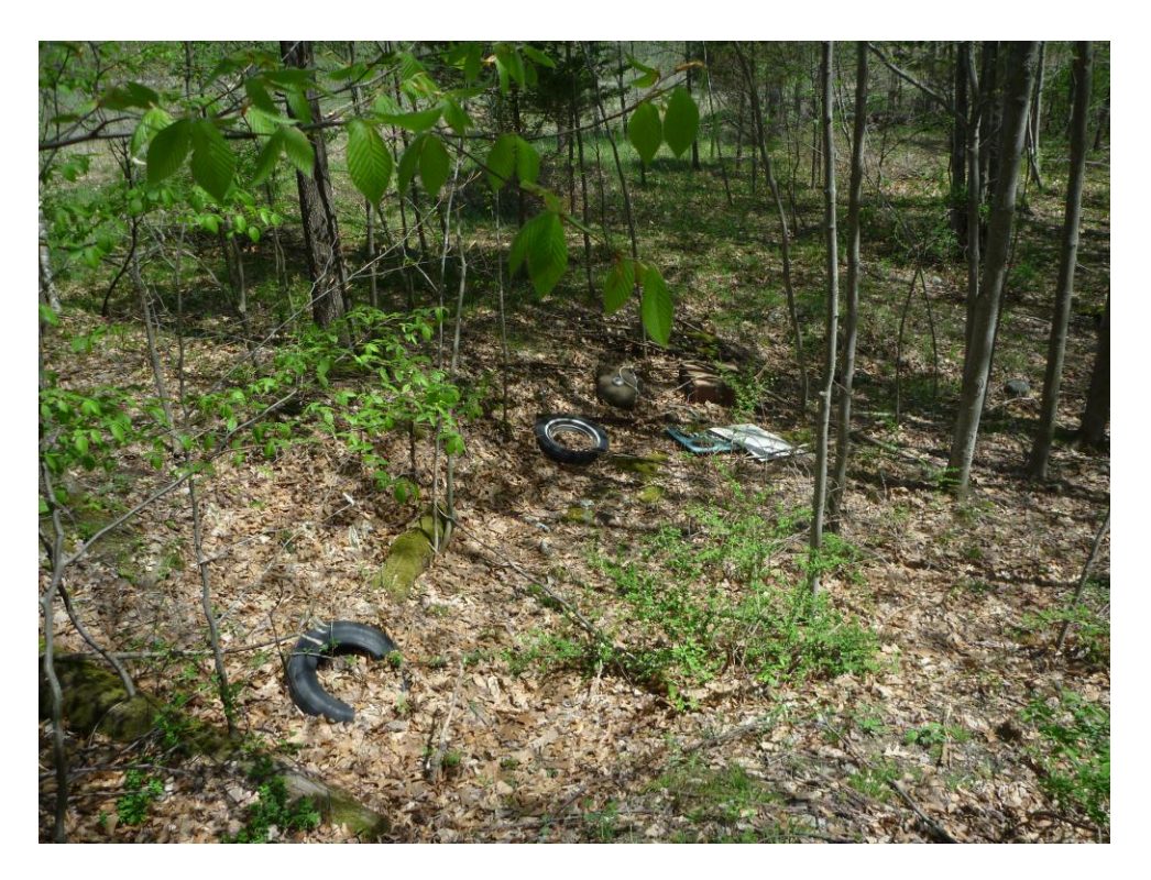
Photograph 20: Debris pile #10, containing tires and miscellaneous debris. View from north to south.