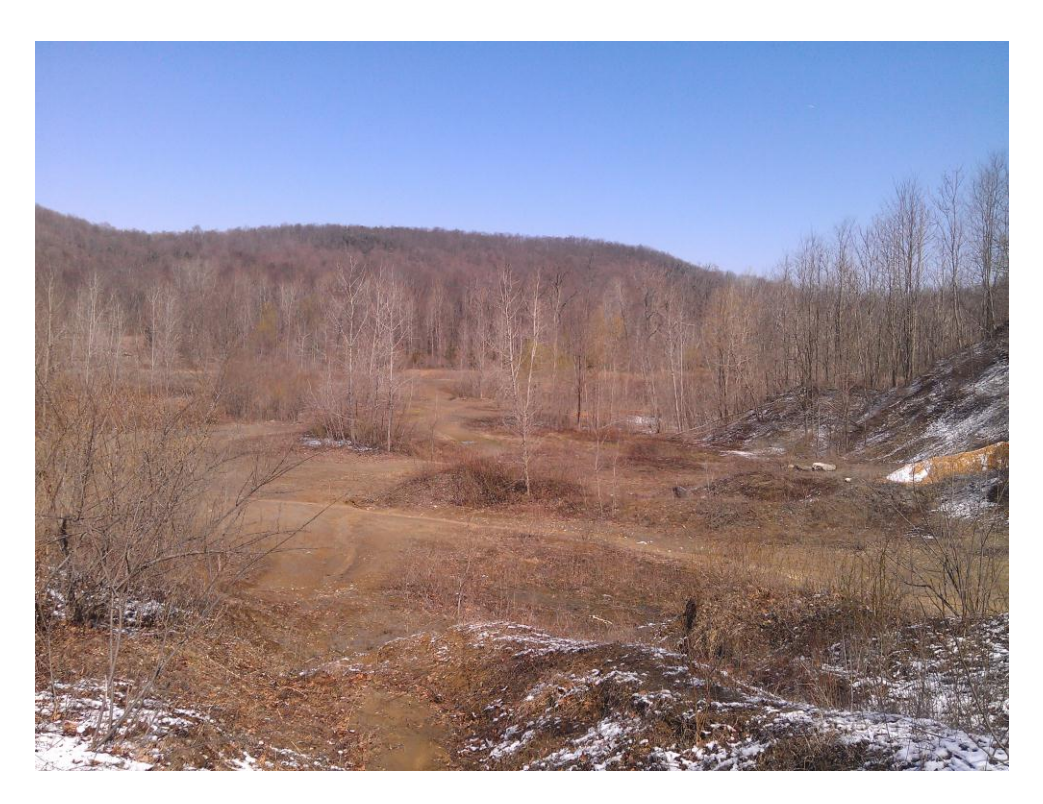
Photograph 12: Permitted sand and gravel mine (Parcel #1). View from southeast to northwest.

Photograph 11: View of contractor supplies stored north of Jerry Medina and Sons occupied staging area (southeastern portion of permitted mine). View from west to east.