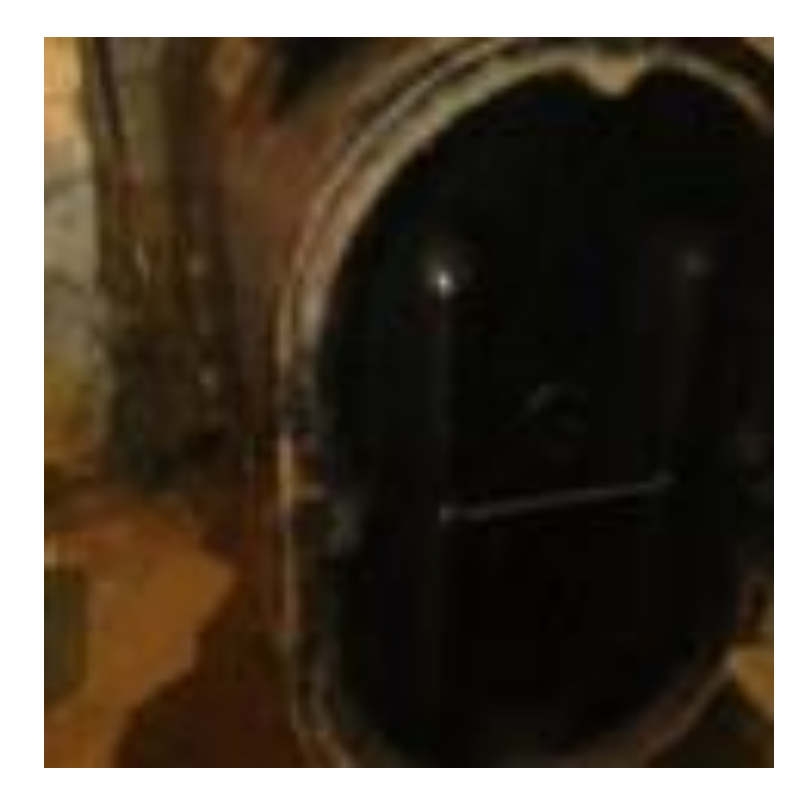
Photograph 13: View of heating oil AST in basement of Caruso residence (Parcel #1). View from south to north.