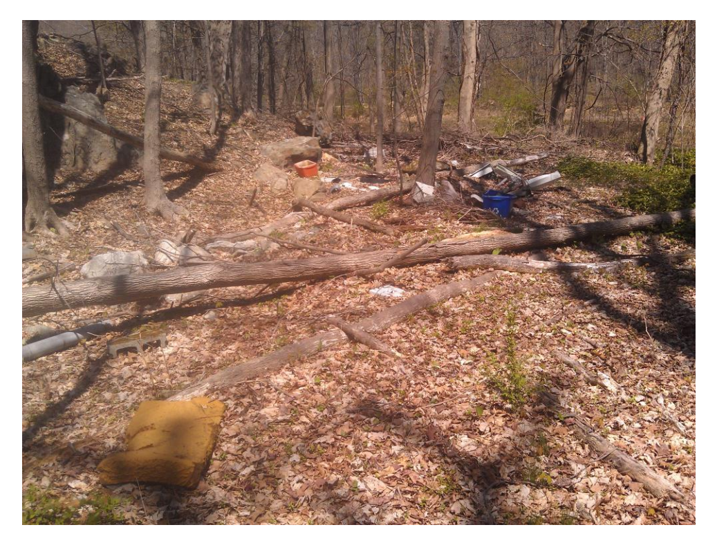
Photograph 28: Debris pile #1, containing miscellaneous debris south of Caruso residence along northern perimeter of Parcel #2. View from southwest to northeast.

Photograph 27: Debris pile #1, containing tires, black flexible pipe, plastic debris, and bagged waste south of Caruso residence along northern perimeter of Parcel #2. View from southeast to northwest.