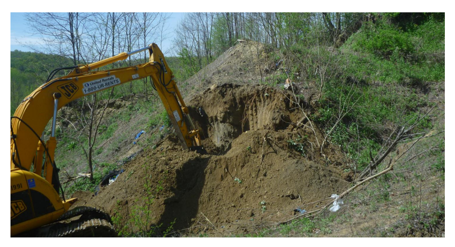
Photograph 13: View of the clean sand observed at TP-9