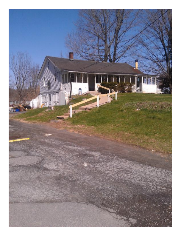
Photograph 5: McLaughlin residence. View from southeast to northwest.