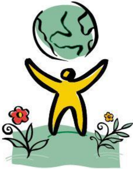
Figure 4: Based on established research and theory in child development and education, The World at Their Fingertips continuously evolves, reflecting new research and best practices in the field of early education, along with our close relationship to NAEYC.

Beginning with their initial enrollment, we assign each family to a primary caregiver to ensure that children and families receive individualized attention. Primary caregivers play special roles and are responsible for children's prime times: those critical one-to-one moments of caring, play, education, nurturing, and communication.