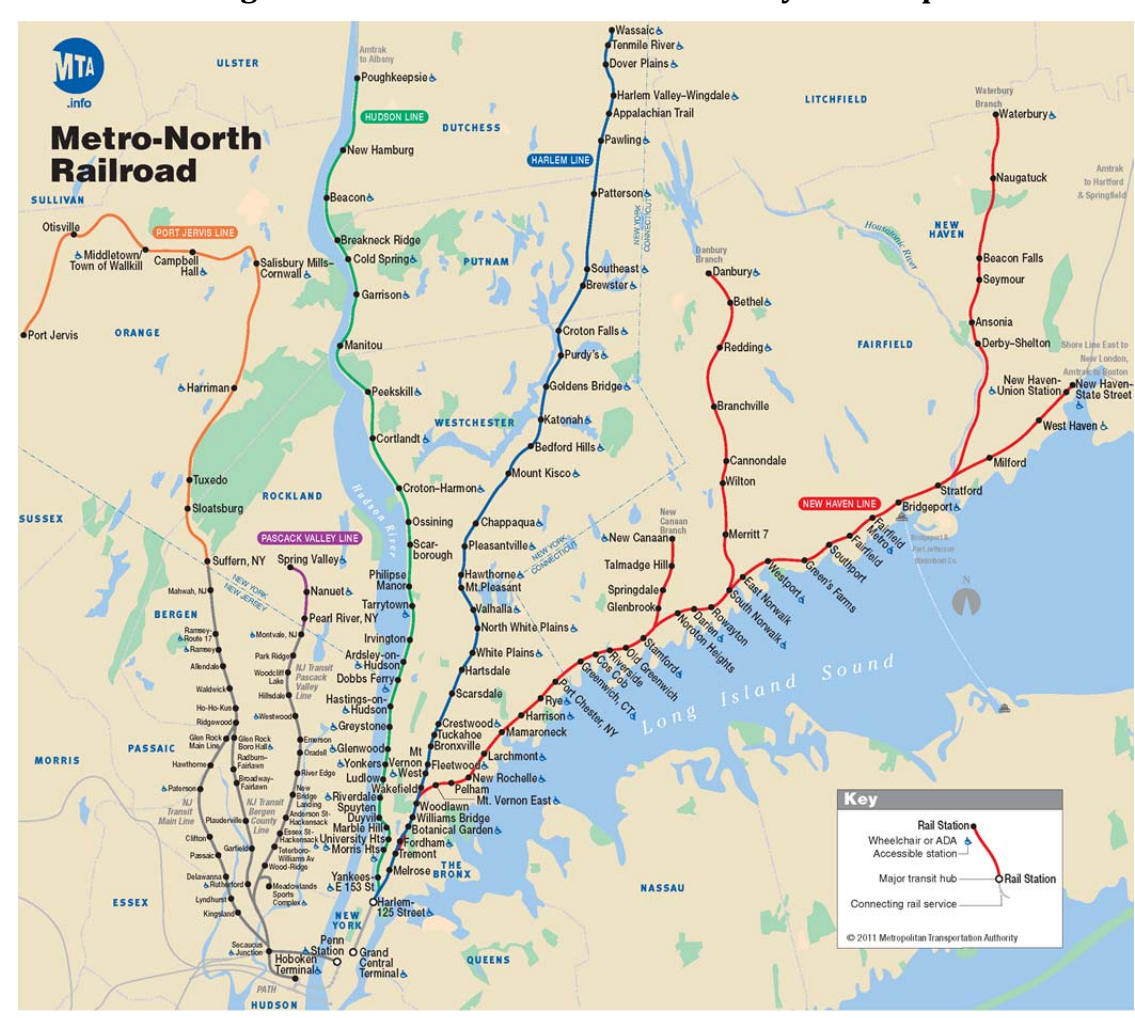
Figure X. C.1-1. Metro-North Railroad System Map